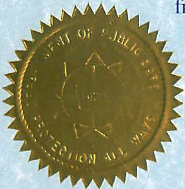
Commissioner, Department of Public Safety

from the date of issuance March 31, 2013 unless sooner terminated.